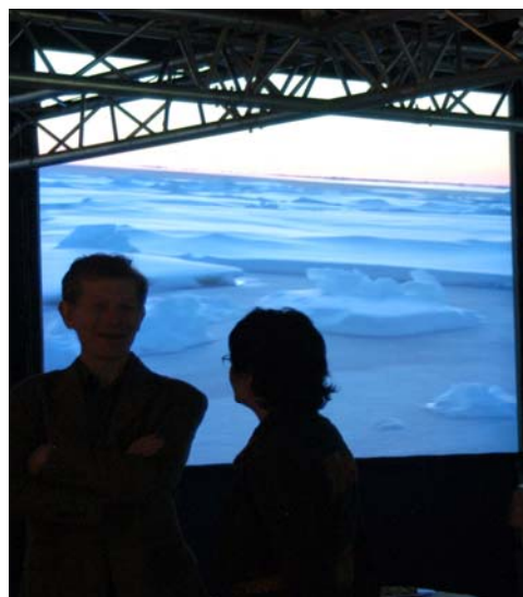
Tara Sea Imagery.

few! Many schools also took part in the IPY celebrations by carrying out the various ice experiments listed on the IPY website as well as launching hundreds of virtual balloons. You can see the full list of events at http://www.ipy.org/index.php?/ipy/detail/launch/ or download the webcasts from the Arctic Portal website at http://www.arcticportal.org .