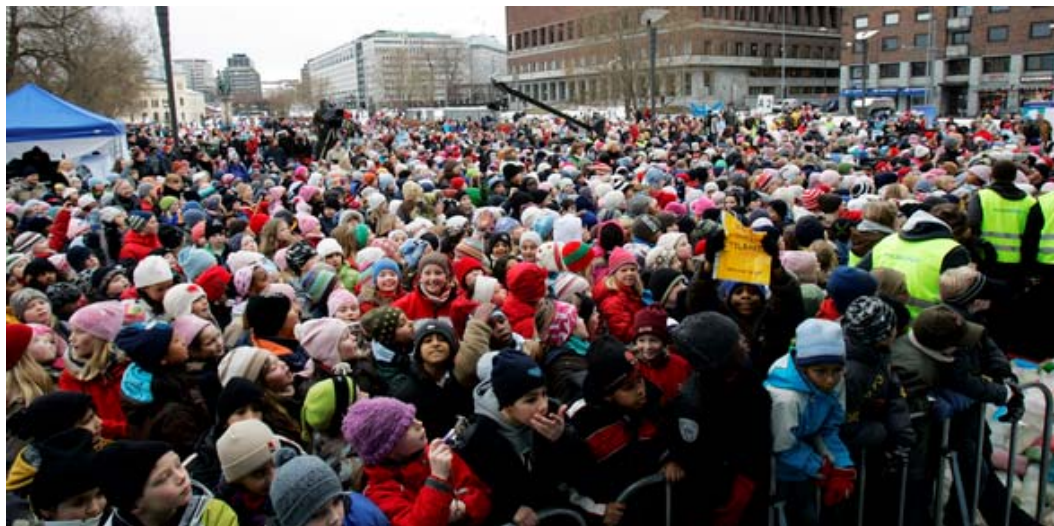
School children celebrating IPY in Oslo, March 1, 2007

Welcome to the second issue of the International Polar Year (IPY) International Programme Office (IPO) bi-monthly newsletter. IPY is co-sponsored by the International Council for Science (ICSU) and World Meteorological Organisation (WMO). The aim of this newsletter is to provide you with updates on IPY IPO activities throughout IPY and alert you to any new developments or events.